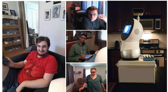
Fig. 1. The Interruptions Skills Training and Assessment Robot (ISTAR) is designed to help adults with Autism Spectrum Disorders (ASD) practice handling interruptions in their home, therefore providing workplace-relevant skills training in an intuitive and organic way. The collage on the left illustrates typical interactions between the system and an adult with ASD in four home deployments. On the right is a depiction of the system in a user’s home.

Finding and maintaining employment is complex and involves several stages from submitting a job application or participating in an interview, to navigating the responsibilities and expectations once employed. Each stage demands an ability to adapt to unforeseen circumstances and recover effectively from interruptions. Empirical research demonstrates that commonplace interruptions can result in significant lost work, costly errors, or safety violations [13], [16]. We are motivated to study interruptions due to their frequency in the workplace [15] and their measurable effect on workflow [8].