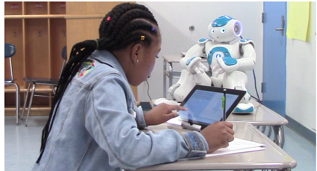
Figure 1: We studied the effects of the AT-POMDP policy on student learning in multiple tutoring sessions with a robot.

Although most prior work has focused on modifying and optimizing a single component of the robot-student tutoring interaction (e.g. building a model of student knowledge,