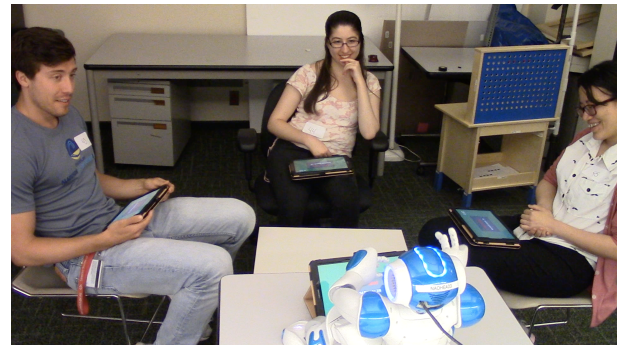
Figure 1: Participants played a collaborative game with a robot, who either made vulnerable or neutral statements during the game.